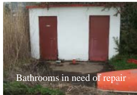
Bathrooms in need of repair