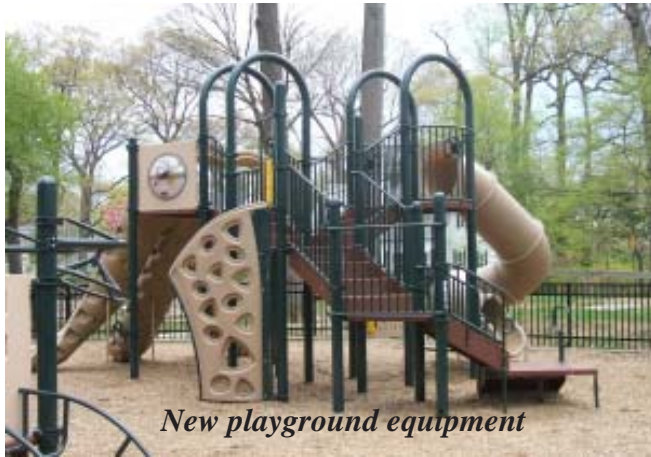
New playground equipment